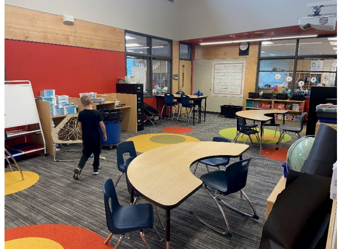
Flexible and collaborative learning spaces adjacent to classrooms at Lynden Middle School and Fisher Elementary